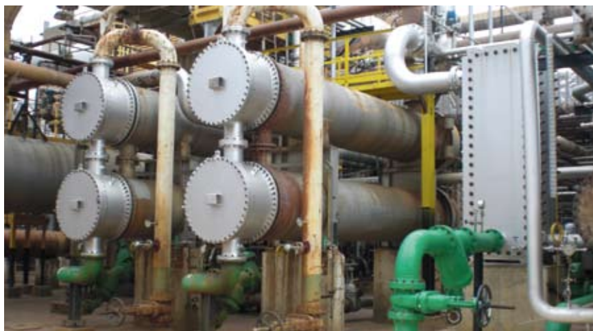
With its compact design, compared to a shell-and-tube heat exchanger, Compabloc can be installed where floor space is limited.

In 2005, Replan replaced two shell-and-tube units with one Compabloc vertical condenser at the vapour compression stage, providing 20% additional heat transfer capacity in a smaller space. Two more Compablocs, with plates in 254 SMO, were installed in the naphtha fractionation unit as top condensers in 2007.