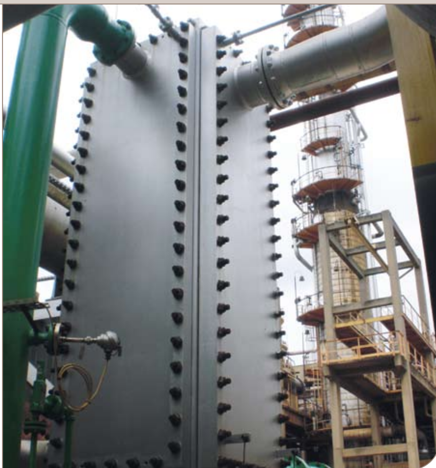
Petrobras' Replan Refinery in São Paulo has installed Alfa Laval Compabloc compact heat exchangers in the sour water stripping unit and the FCC unit.

Osmar Vallim Pedrosa: "We chose compact heat exchangers due to their high efficiency. Also because it's possible to install a Compabloc in a reduced footprint area for revamping projects. To get the same heat transfer capacity using shell-and-tube units requires more space, and material and installation costs are much higher."