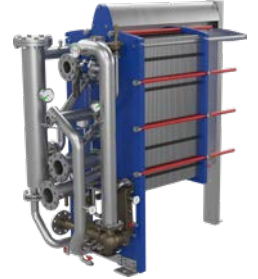
Two-stage freshwater generator AQUA Blue E2