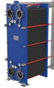
Marine gasketed plate heat exchanger