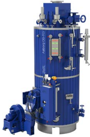
Methanol-ready steam boiler system type Aalborg OS-TCi