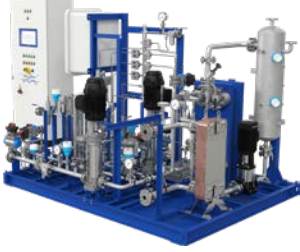
Fuel supply system FCM Methanol