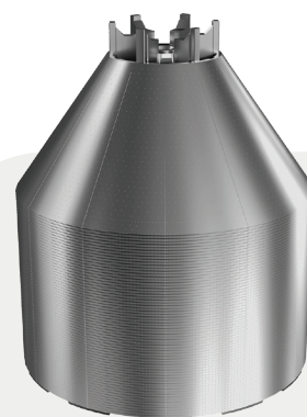
UniDisc for Brew 450