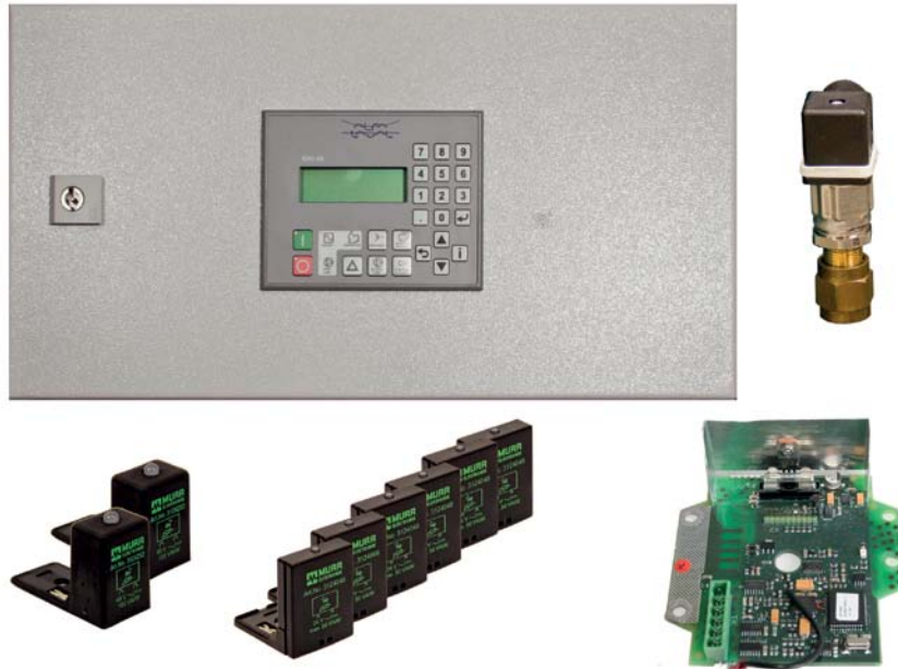
The Alfa Laval EPC 60 Retrofit kit for FOPX, LOPX and MFPX separators.