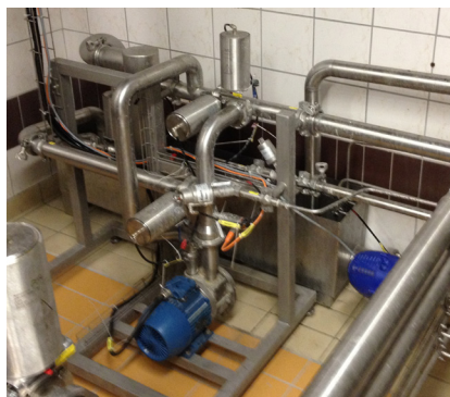
The eMotion unit is installed on a separate skid and takes up minimal space.