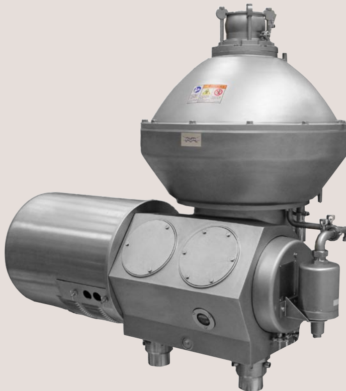
MBPX 810H complete with motor

Medium-sized solids-ejecting centrifuge for the fermentation & biotech industries