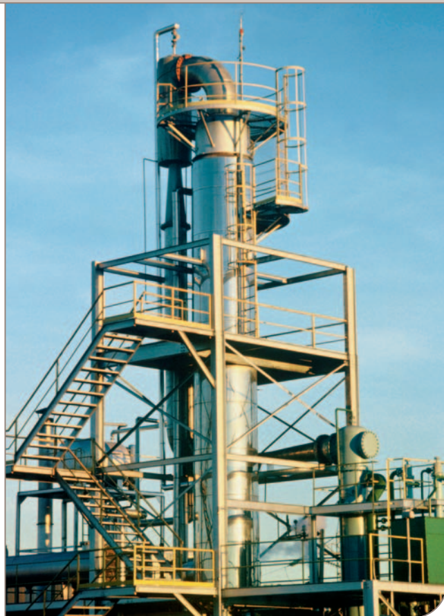
Installed stripping column

Due to the special design of the packing, which creates turbulence between the plates, and the fact that there are no stagnant zones, a self-cleaning effect ensures continuous operation.