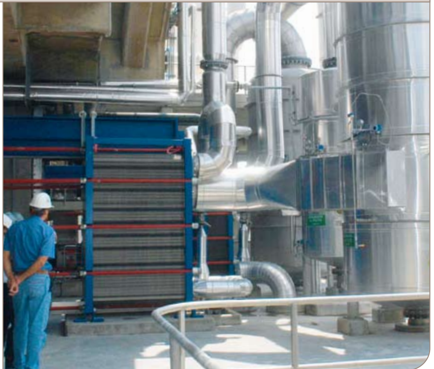
The AlfaVap evaporation system uses about 40 to 50% less energy than the evaporators and condensers used previously.

The process that converts corn to products such as corn syrup and modified starches starts with corn that is allowed to macerate for 48 hours in tanks containing sulphur diluted in water. The water is subsequently extracted, creating the so-called corn steep liquor (CSL), which is the effluent of the plant. CSL