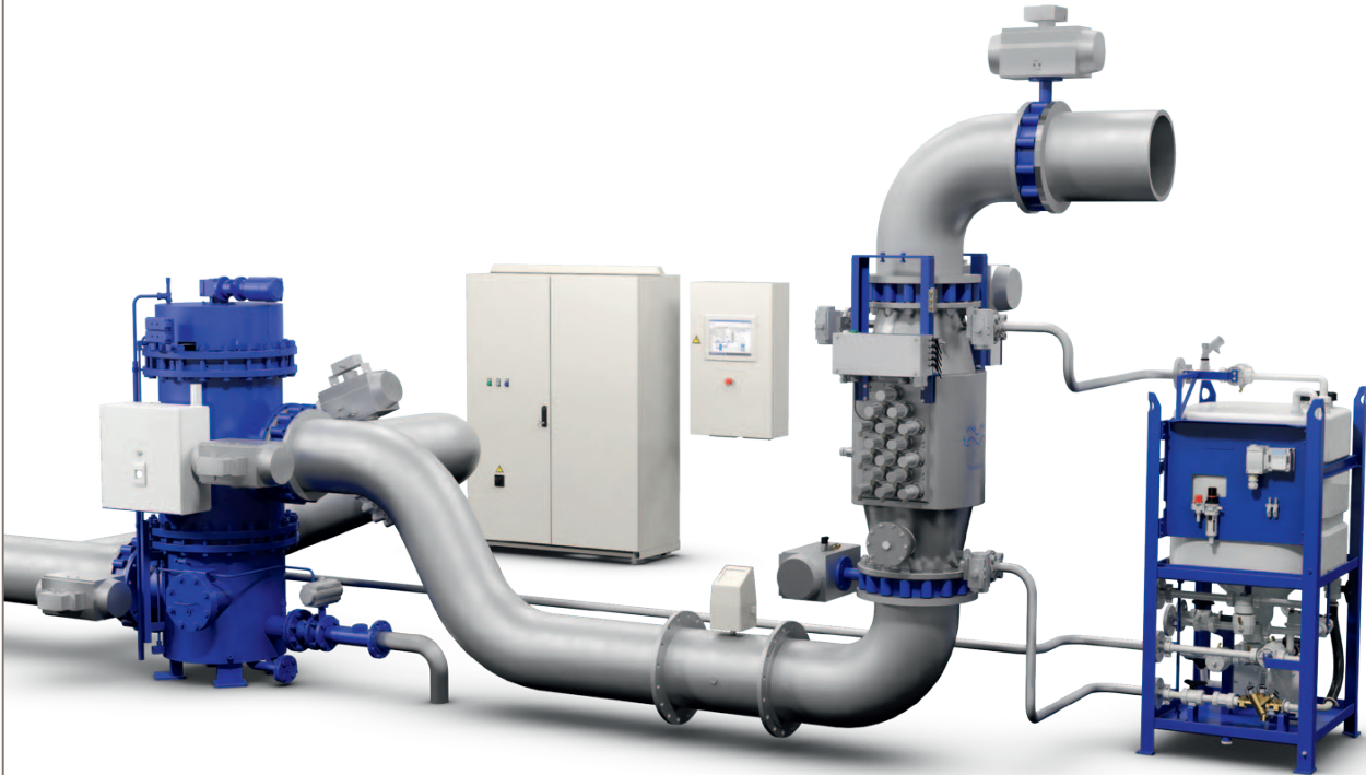
PureBallast 1000 system

PureBallast 3.0 effectively neutralizes organisms in ballast water. The new system is smaller and more flexible than its predecessors, yet it consumes 30-60% less power.