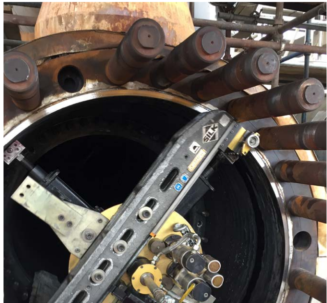
Machining of gasket surfaces on a shell-and-tube heat exchanger using a custom-built boring machine.