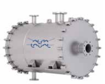
SpiralPro for steam heater duties