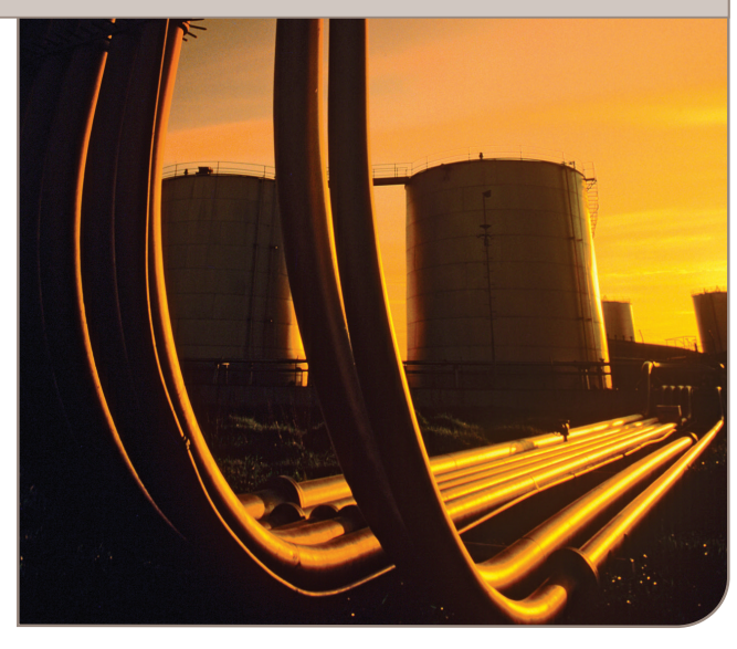
Since 2002, spiral heat exchangers from Alfa Laval have handled the entire visbreaking bottom cooling duty at the refinery.

Nevertheless, spiral heat exchangers were new for the company. So in 2001 when Alfa Laval presented their proposal for replacing the 12 shell-and-tube heat exchangers at the new plant with eight spiral heat exchangers, the company wanted proof that their investment would payoff.