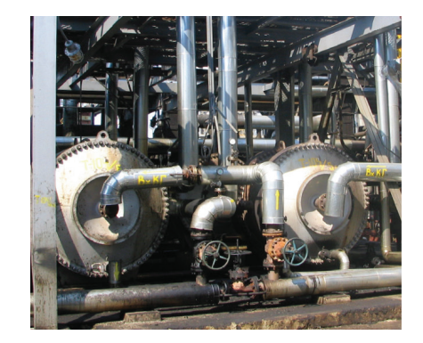
Two of the eight spiral heat exchangers.