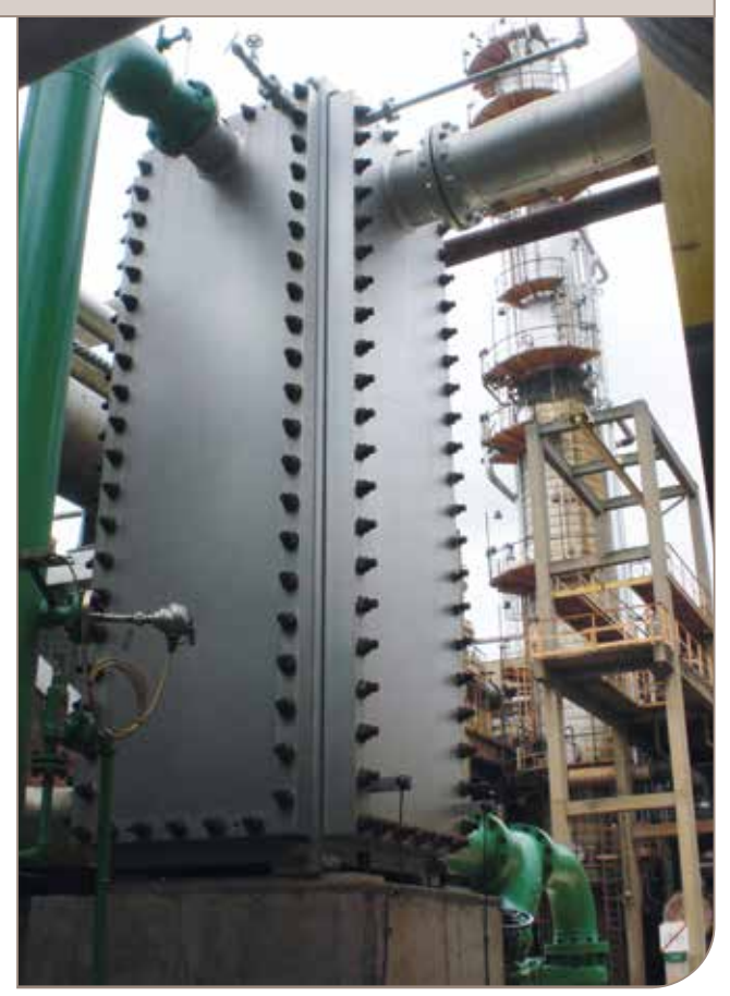
Petrobras' Replan Refinery in São Paulo has installed Alfa Laval Compabloc compact heat exchangers in the sour water stripping unit and the FCC unit.

The first of Replan's eight Compablocs, installed in 2002, operates as a condenser in the sour water stripping column. Equipped with titanium plates, the unit replaced an existing shell-and-tube unit with a tube bundle in AISI 304 which was facing serious corrosion problems. These were primarily due to high contents of chlorides and hydrogen sulphide in the