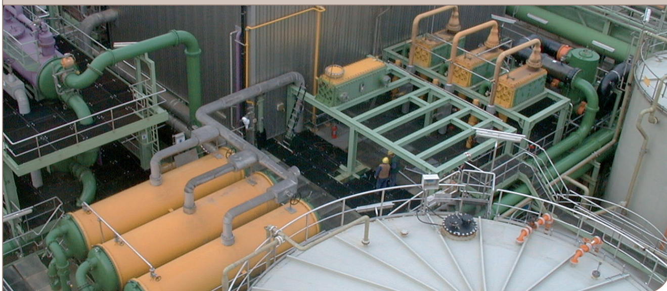
Three Compablocs (top right) with 50% higher capacity replaced three S&Ts (lower left) on half the footprint.

A major European chemical company increased production reliability by replacing shell-and-tube (S&T) condensers with Alfa Laval Compabloc condensers. Utilising only half the space of the old shell-and-tube installation, the Compablocs solved a corrosion problem and at the same time generated considerable savings in capital cost. “Big is not beautiful anymore at this site”, says the plant engineer.