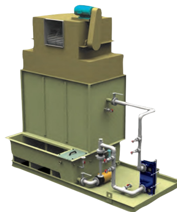
Liquid desiccant packaged conditioner

Alfa Laval Kathabar Phone +1 716-875-2000 Email: sales.kathabar@alfalaval.com Web: www.kathabar.com