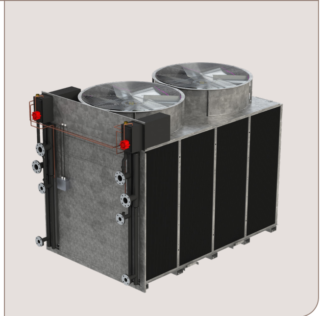
DCH Gen-set radiator unit

3-Phase 400V-50Hz squirrel cage induction motors (IEC) are used, on demand 460V-60Hz or other power supply. Protection Class IP55, temperature class F or H, depending to the working conditions. On demand greasers can be included. Each electric fan motor is wired to a terminal box or a safety switch close to the fan cowl.