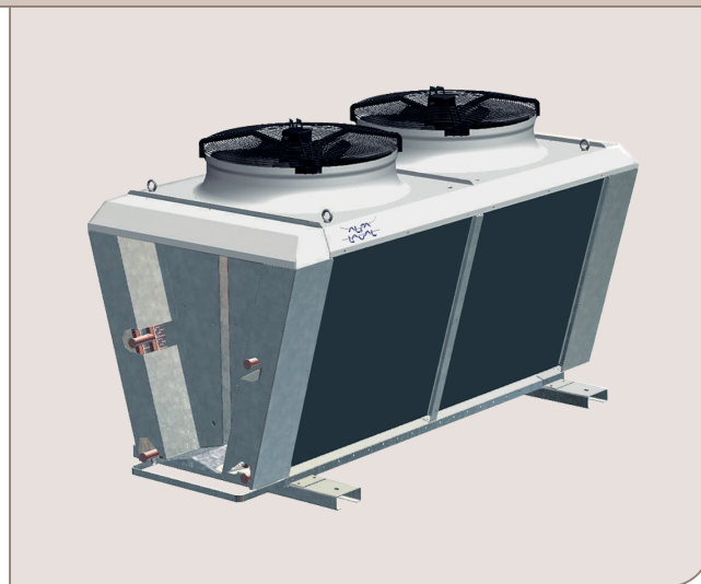
Alfa-V Single Row