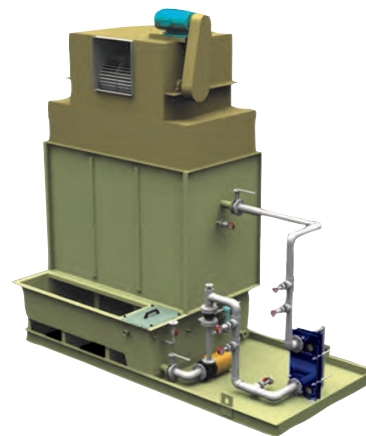
Liquid desiccant packaged conditioner

Alfa Laval Kathabar Phone +1 716-875-2000 Email: sales.kathabar@alfalaval.com Web: www.kathabar.com