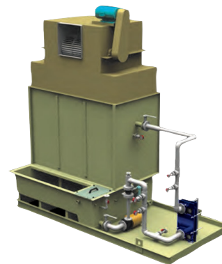
Liquid desiccant packaged conditioner

Alfa Laval Kathabar Phone +1 716-875-2000 Email: sales.kathabar@alfalaval.com Web: www.kathabar.com