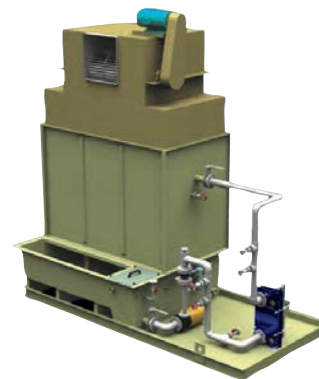
Liquid desiccant packaged conditioner

Alfa Laval Kathabar Phone +1 716-875-2000 Email: sales.kathabar@alfalaval.com Web: www.kathabar.com