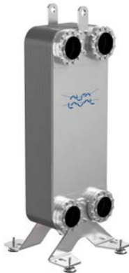
Alfa Laval AlfaNova™

A design built to support multiple asymmetries, such as Alfa Laval's patented FlexFlow™ pattern, is therefore key to enabling the most efficient performance, regardless of which refrigerant is chosen. Working with a supplier who has the capability to fully adapt a channel plate pattern makes it possible to achieve the optimal multi-refrigerant platform when designing a new system.