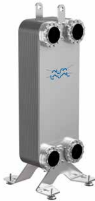
Alfa Laval AlfaNova™

A design built to support multiple asymmetries, such as Alfa Laval's patented FlexFlow™ pattern, is therefore key to enabling the most efficient performance, regardless of which refrigerant is chosen. Working with a supplier who has the capability to fully adapt a channel plate pattern makes it possible to achieve the optimal multi-refrigerant platform when designing a new system.