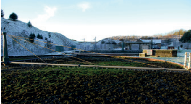
Effluent generated by trickling filters is more difficult to treat compared to activated sludge effluent.

The effluent generated by trickling filters has very fine particulate suspended solids compared to an activated sludge effluent, and can be regarded as a difficult effluent to treat.