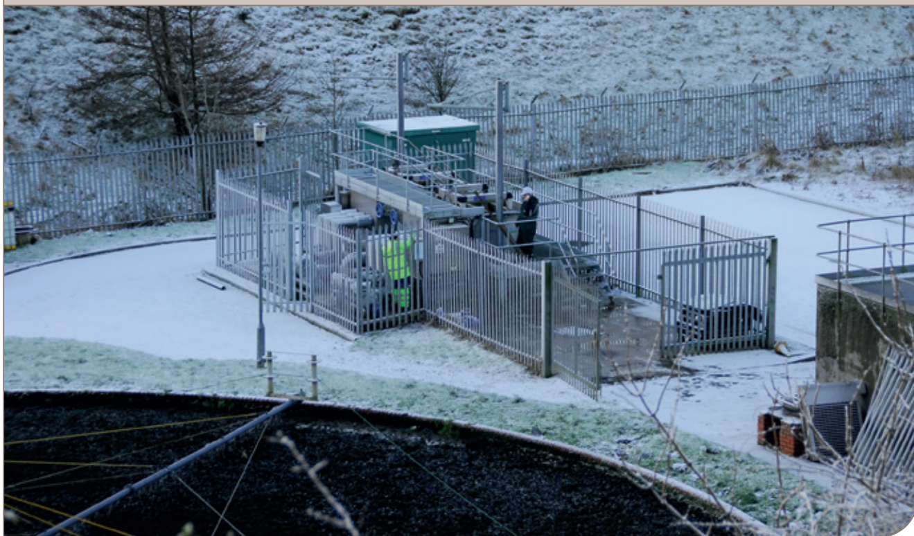
Two Alfa Laval AS-H Iso-Disc® Cloth Media Filters at Scottish Water's Fauldhouse Sewage Treatment Works

Scottish Water upgraded their old sand filters with two compact, fully automatic Alfa Laval AS-H Iso-Disc® Cloth Media Filters for tertiary treatment at their Fauldhouse wastewater treatment plant. The Iso-Disc filters deliver a far superior final effluent quality than what is required by the local suspended solids discharge criteria.