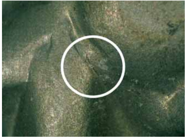
Close-up image of crack found in a plate.

Alfa Laval support ensured that the customer's heat exchanger was replaced with a new unit that has many more years of reliable service ahead.