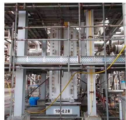
Compabloc on site at PTTGC's Aromatics Complex 1 plant. The small footprint makes Compabloc easy to fit into existing structures.

the incoming stream on the cold side. A small CAT means as much as possible of the heat has been recovered. The average CAT for the Compabloc is 9°C (16°F) compared to 25°C (45°F) for the shell-and-tube. To maintain this average CAT for the shell-and-tube, the unit had to be cleaned much more frequently than the new Compabloc due to its much higher susceptibility to fouling.