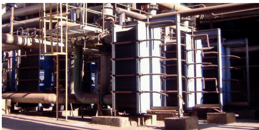
Alfa Laval WideGap plate heat exchangers, for fibrous media, installed at SantelisaVale's Sertãozinho sugar and ethanol plant.

set two units are in operation while the third is being cleaned.