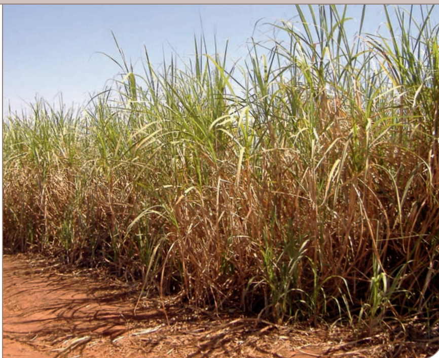
Sugar cane crops, the basic raw material for Brazil's sugar and ethanol industry.

The Sertãozinho cane sugar mill produces both thermal and electrical energy, so-called co-generation. Bagasse, the fibre remaining after the extraction of the sugar-bearing juice from the sugar cane, is used as fuel in a boiler. The bagasse produces more than enough steam to