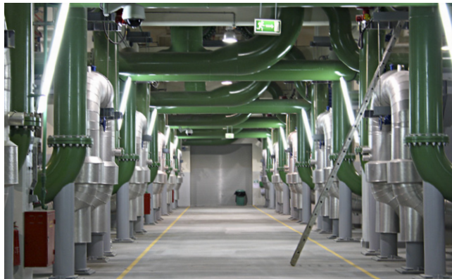
From the cooling plant, a pipe network provides the cooling for all the amenities – residential, commercial and sportive – for the entire man-made island of The Pearl Qatar.

We expect ourselves working with Alfa Laval as long as Qatar Cool performs installations. So far – during six years of close cooperation – no single failure or underperformance of their equipment has been observed. Over a course of six years, this is obviously not something you can attribute merely to good luck.”