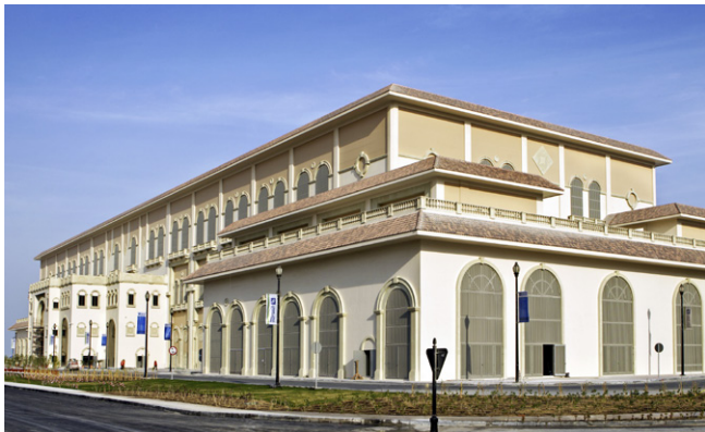
The building accommodating the cooling plant has an architecture brought into harmony with the surrounding buildings.