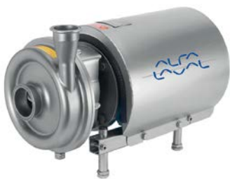
The Alfa Laval LKH centrifugal pump.

What lies ahead for the TINE Byrkjelo dairy? According to Heieren, the company is committed to creating good food for moments for people. Continuous innovation and process improvement will ensure a sustainable future both for TINE customers as well as the TINE dairies.