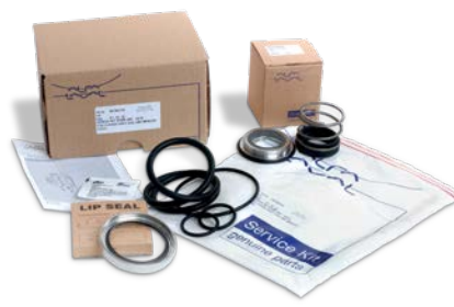
The Alfa Laval Service Kits.