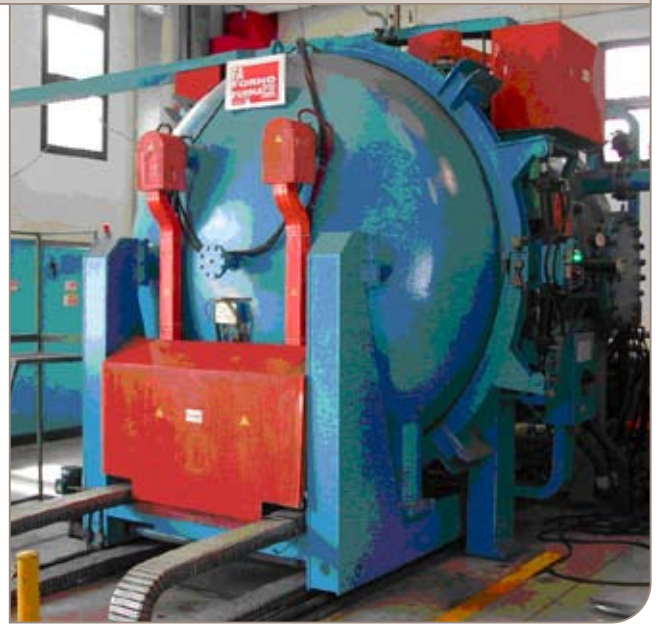
Two furnaces like this are cooled by an Alfa Laval dry cooler

The entire plant is shown in the following block below: a pump moves a fixed quantity of water from an underground tank through the furnace jackets, while another pump moves water from the same tank through the dry cooler.