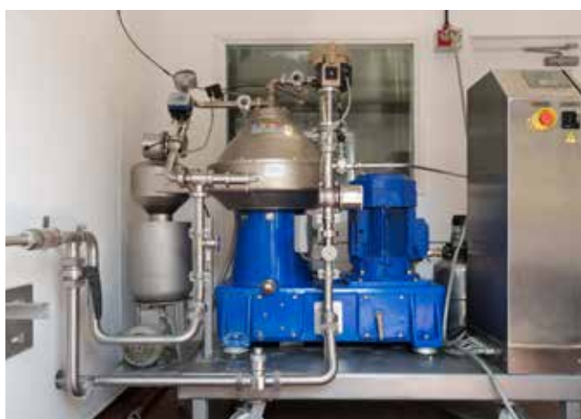
BREW 80 separator module.

manship and prize-winning quality for which Rebellion Beer has become renowned. The plans included new brewhouse equipment, a new fermentation tank room equipped with new fermentation vessels, and a new on-site retail outlet.