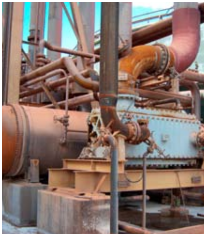
The Compabloc replaced a shell and tube unit on a quarter of the footprint.