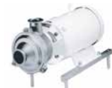
MR liquid ring pump