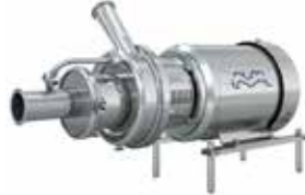
LKH Prime UltraPure