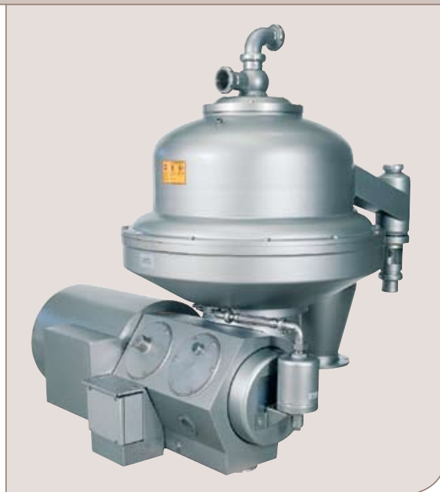
AFPX 617 complete with motor

The machine consists of a frame that has a horizontal drive shaft with clutch and brake, worm gear, lubricating oil bath and vertical bowl spindle in the lower part. The bowl is mounted on top of the spindle, inside the space formed by the upper part of the frame, the ring solids cover, the collecting cover, and the frame hood. The feed and liquid discharge system, including the paring disc pump for the heavy phase, also rests on this structure. All parts in contact with the process liquid are made of stainless steel. The bowl is of the solids-ejecting disc type with a hydraulic operating system for “shooting” (for automatic or manual operation). The electric motor is of the variable frequency drive type or of controlled-torque type.