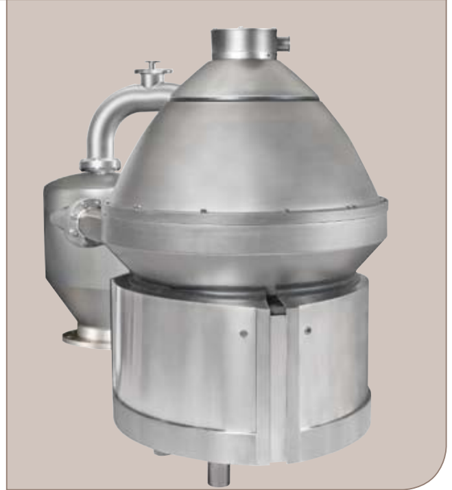
BREW 701 complete with direct drive system.

All metallic parts that come in contact with the process liquid are made of high-grade stainless steel. Liquid-wetted rubber gaskets are made of FDA approved nitrile rubber. The frame upper part and the hood are cooled with water, which minimize temperature increase of the process medium and at the same time acts as a sound dampener.