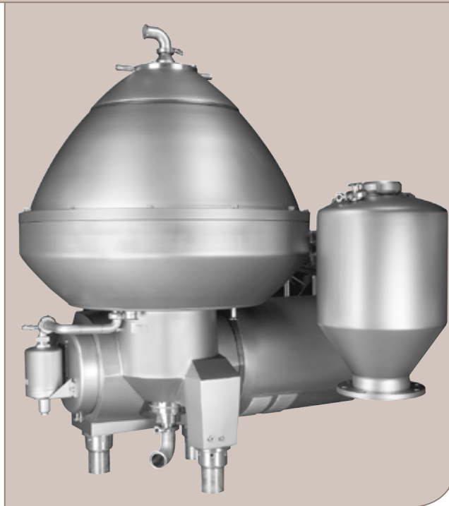
BREW 501 complete with motor

All metallic parts that come in contact with the process liquid are made of high-grade stainless steel. Liquid-wetted rubber gaskets are made of FDA approved nitrile rubber. The frame upper part and the hood are cooled with water, which reduces