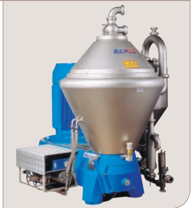
The complete BREW 2000 with motor

Centrifuge with motor, set of tools, speed sensor, vibration switch, vibration dampening feet, foundation plate and standard set of spares.