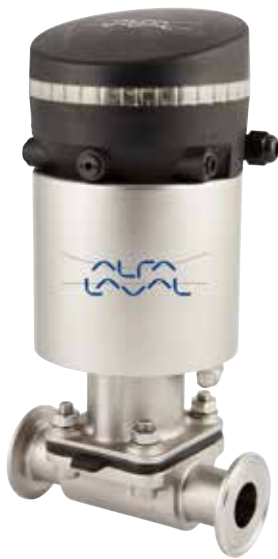
Image 2. Alfa Laval DV-ST designed to reduce pressure drop, and without dead legs.

Unfortunately, there will always be a small amount of bacteria that will grow and multiply – even in the best pharmaceutical water systems. The degree of harm caused by such contaminants is difficult to predict due to variable factors, such as temperature, pH, velocity, stress and heat. Most water systems contain gram-negative bacteria with the outer membrane of the cell wall, which releases endotoxins when the bacteria are killed. If injected into the bloodstream, these endotoxins cause fever and, in the worst-case scenario, septic shock which can be fatal.