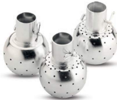
Image 1. Alfa Laval LKPK Static Spray Balls

Static spray ball the low impact and high flow of cleaning media combined with the force of gravity to clean the tank.