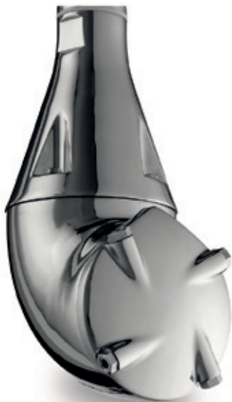
Image 2. Alfa Laval TJ20G Rotary Jet Head

Rotary jet head use the high impact and low flow of cleaning media to clean the tank.