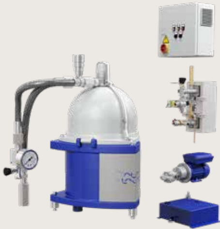
MIB 503 separation system

Alfa Laval MIB 503 systems and modules offer a highly efficient and compact separation solution. They improve the reliability of fuel and oil systems and protect your engine from serious wear and damage.