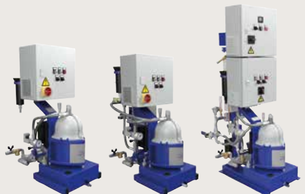
MIB 503 separation modules