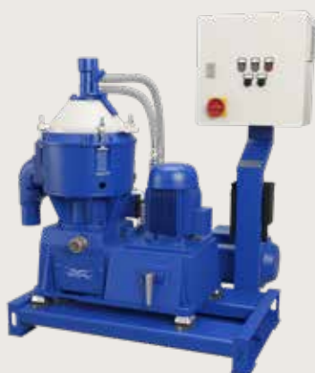
MMB separation module