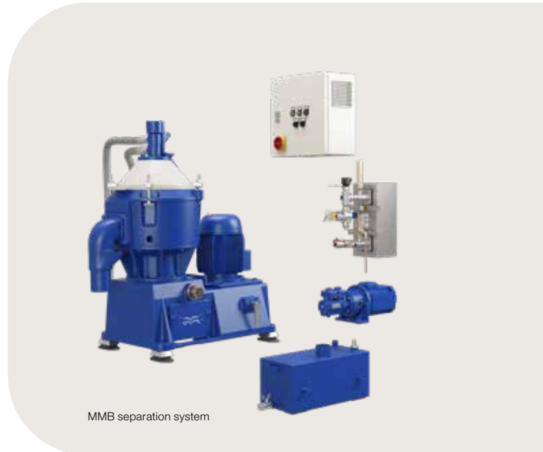
MMB separation system

All functions and alarms are handled from the control cabinet.