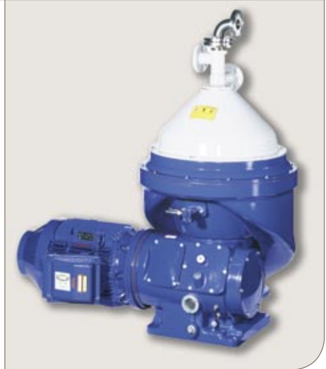
Fig. 1 GT 50

Process components, including inlet and outlet pipes, valves