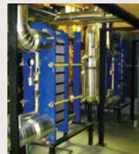
Cogeneration – keeping the Towers self-sufficient

The Rochaverá Corporate Towers are Green-certified according to LEED (Leadership in Energy and Environmental Design).