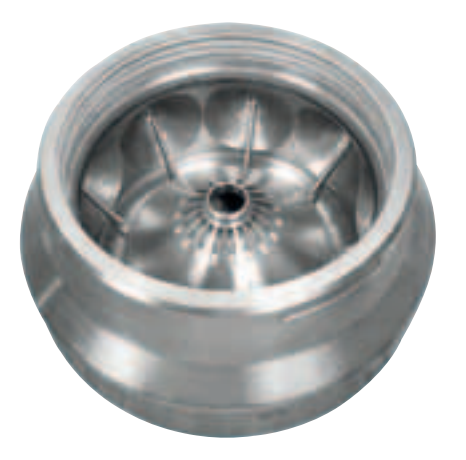
BRUX 510 bowl