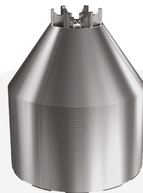
UniDisc for Brew 701