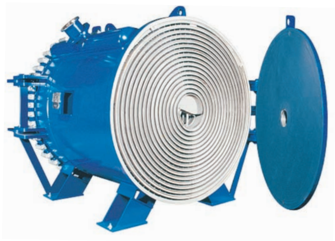
Spiral heat exchangers

The bottom line: The refinery saves EUR 1.1 million per year in terms of maintenance, heat recovery and restored throughput.