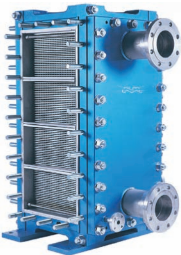
Compabloc heat exchangers

Hydroblasting is typically all it takes to clean a Compabloc or spiral heat exchanger. No time-consuming drilling is required to open up clogged tubes. And thanks to their compact size, the water jet reaches every corner of each unit with equally high pressure. The bottom line: cleaning a compact welded heat exchanger is 4-10 times faster than cleaning a shell-and-tube.