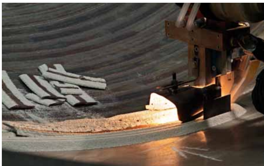
Alfa Laval Olmi solutions have been tried, tested and praised on almost 300 sites across the world.