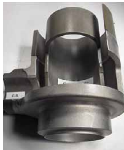
Hot end of Olmi patented solution.

Alfa Laval Olmi PQEs solve the problems of traditional solutions and answer to their weaknesses. A common problem has been presence of thermal sleeve