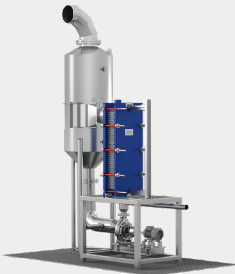
Alfa Laval AlfaFlash

The AlfaFlash is a plate evaporator, working as a forced circulation flash evaporator, often used in the final concentration step as a finisher. It is designed with a high wall shear to minimize viscosity (in case of a shear thinning product), fouling and to maximize time intervals between cleaning. The considerably higher shear rate (already at quite moderate flows) leads to substantially higher heat transfer efficiency, much smaller pumps and significantly lower pump costs.