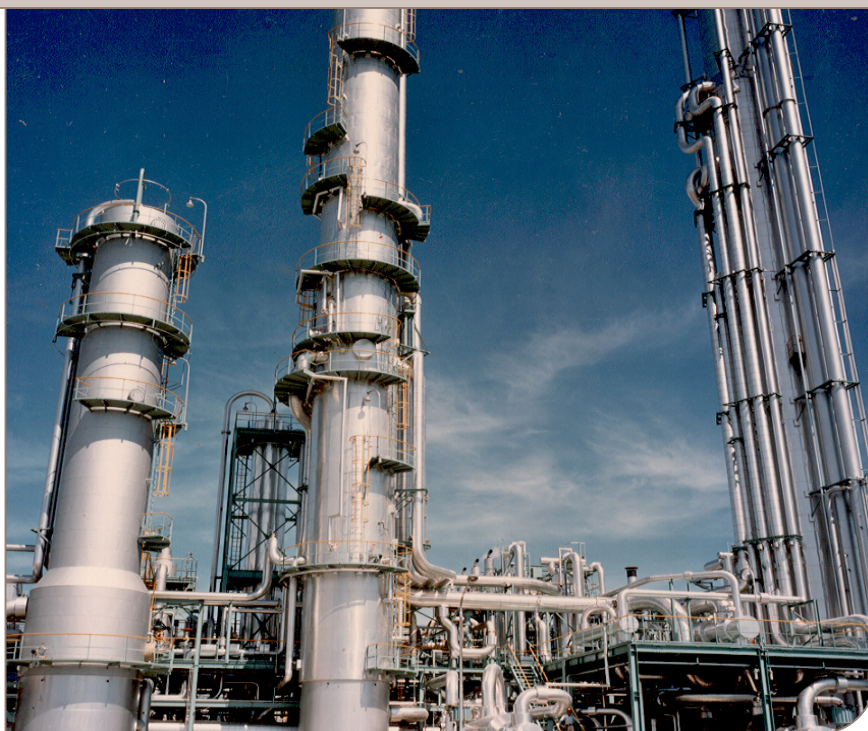
A Compabloc operates with a crossing temperature program and a temperature approach as low as 3°C (5.4°F). So significantly more energy is recovered than with shell-and-tube heat exchangers.

The company's engineers searched for a solution where fouling could be completely eliminated during cleaning, and efficiency maintained over time.